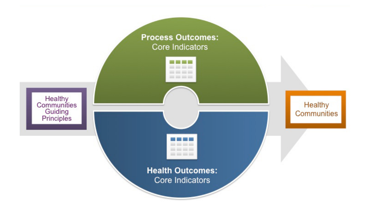
FIGURE 3. HEALTHY COMMUNITIES FRAMEWORK